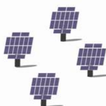
Solar power plants