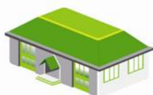
On-grid residential roof-tops